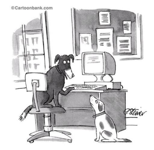
"On the Internet, nobody knows you're a dog."